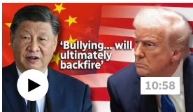
VIDEO U.S. trade war: How China is fighting Trump's tariffs | About That