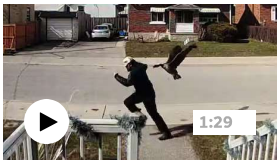
VIDEO #TheMoment angry geese trapped university students inside their home for days