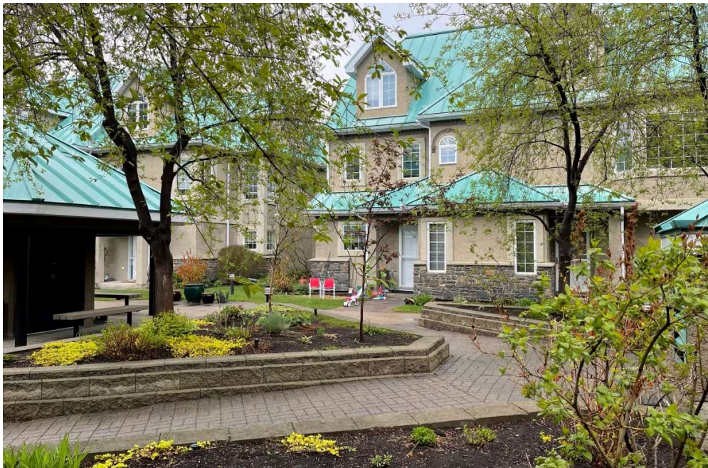
The River Run townhouse complex in Eau Claire features a courtyard surrounded by 23 townhouse units. The complex, built in 1995, will be torn down to make way for an underground LRT station.

CBC News spoke with several townhome owners, some of whom expressed anger at how the city has treated them. They say they won't speak publicly until they meet with their lawyer.