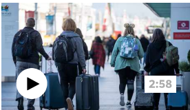
VIDEO Americans feel uneasy about visiting Canada, tourism expert says